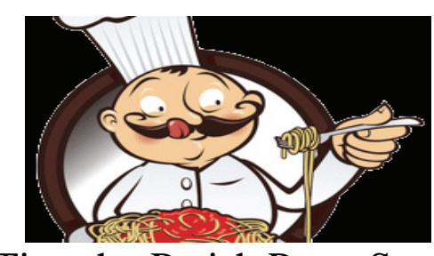
St Timothy Parish Pasta Supper Saturday February 22<sup>nd</sup> at 6:30pm Tickets: $15.00 per person Tickets available after all Masses beginning Feb 1<sup>st</sup> weekend Menu posted on bulletin board