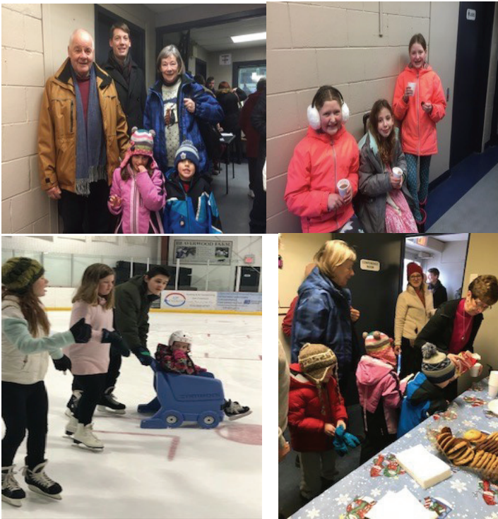
THANK YOU to the Social committee for organizing a fun skating party in celebration of the Feast of St. Timothy!