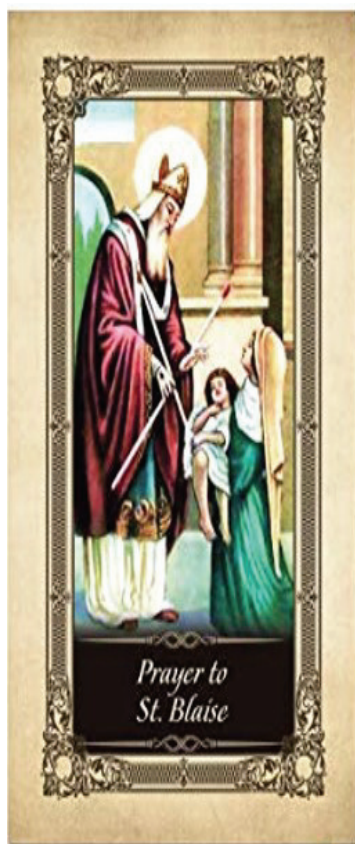
Prayer to St. Blaise