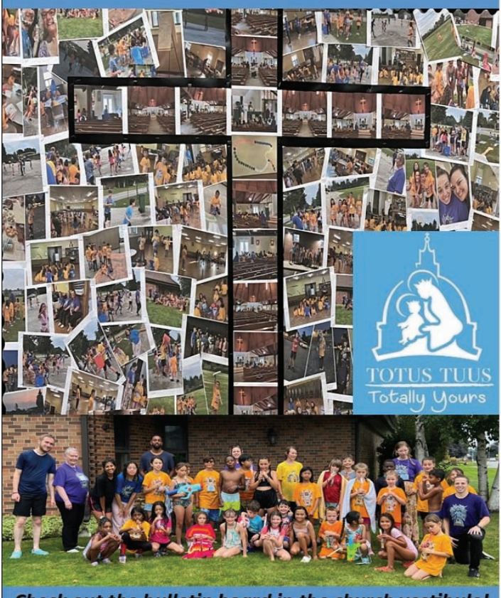
Check out the bulletin board in the church vestibule!