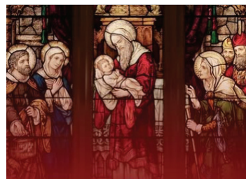
FEBRUARY 2 Feast of the Presentation of the Lord

Pray today to her and invite her into your heart.